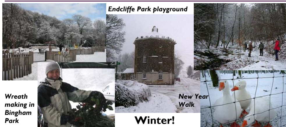
Endcliffe Park playground